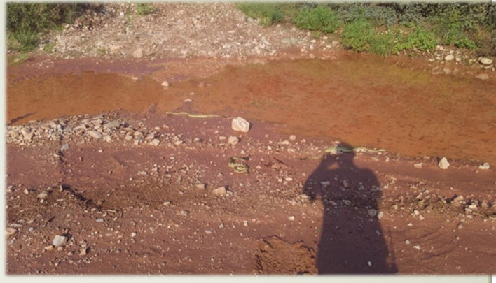
Photo of 3, yes 3! rattlesnakes captured by Jerome Fire Dept. at once