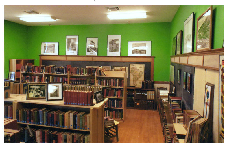
The Old Book Room of the Jerome Public Library houses many collections, including Voltaire, Shakespeare, biographies, local art and old photos.

Or call for an appointment – library staff will be happy to open the Old Book Room for you.