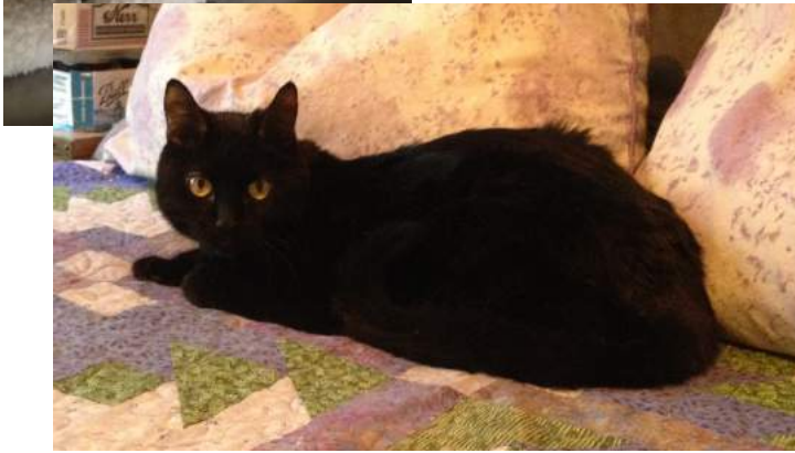
Amber (L) and Greeneyes

foster/hospice care. We need special volunteers who are interested in caring for these wayward pets. We will sponsor medical care. These animals just need a loving, safe environment to live out their later years. Currently, we are looking for such a situation for sister kitties,