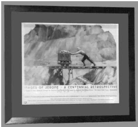
One of the many beautifully framed posters, maps and artwork featured in the Old Book Room.

For all other situations, call police dispatch at 634-2245 .