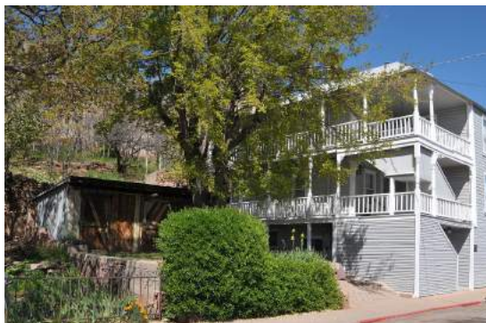
The Rooming House / Phinney House

For more information about the tour, call 928.634.2900.