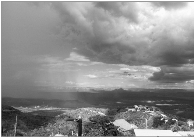
As seen from Jerome Town Hall.